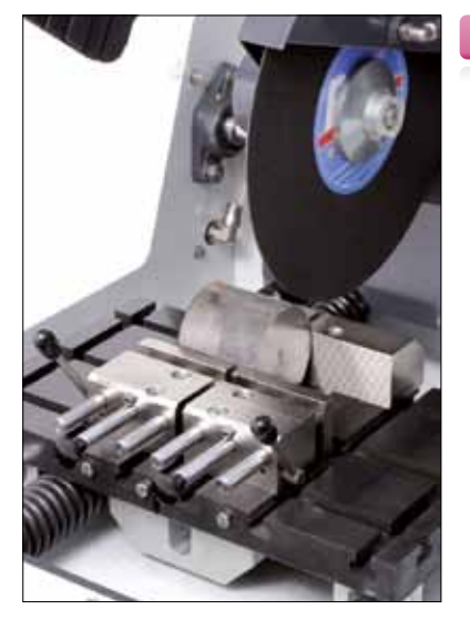
Double quick clamping vices.