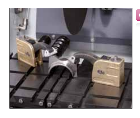
50613 KOPAL holders.