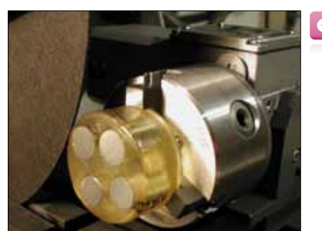
51610 + 51330 Transversal table with rotating holder.